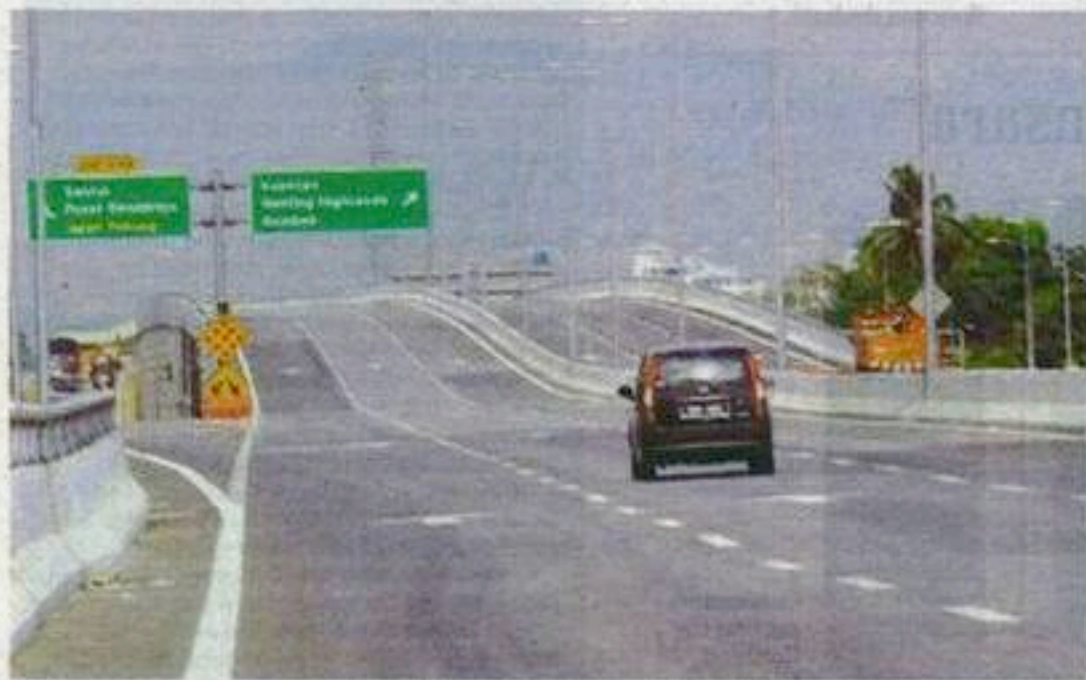
The Duke highway offers an alternative route into Kuala Lumpur.